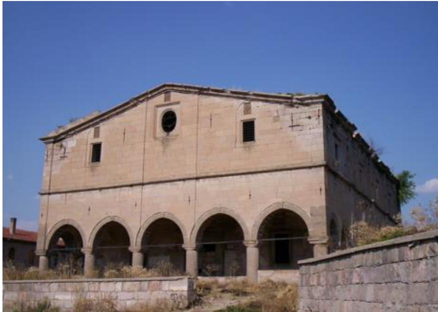
Yanar Taş/Taksiarches Monastery, Cappadocia, Turkey