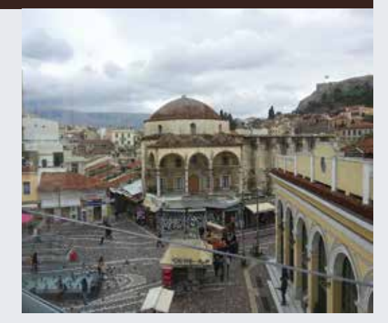
Monastiraki Square, Athens.

Members enjoy exchanging ideas at the biennial Symposia and posting on the exclusive MGSA-L listery, as well as the following benefits: