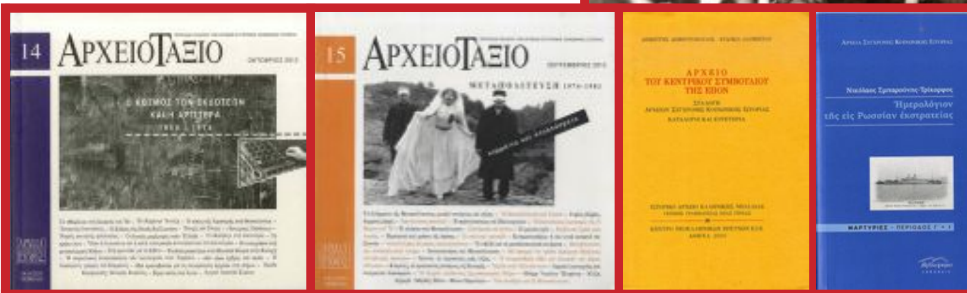
The journal Archeiotaxio and editions