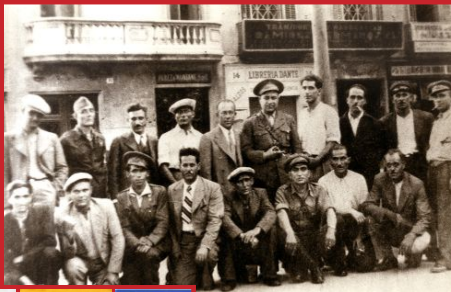
Spanish Civil War (1936-1939): Greek volunteers in the International Brigades

▶ Conferences, workshop meetings and book launches. Along with the National Hellenic Research Foundation and the Panteion University in Athens, it hosts an annual MA seminar for graduate students under the general title ASKI Workshops. It also participates in academic research programs and projects for the digitalization of its archival collections and it hosts an internship program for students from leading Greek universities.