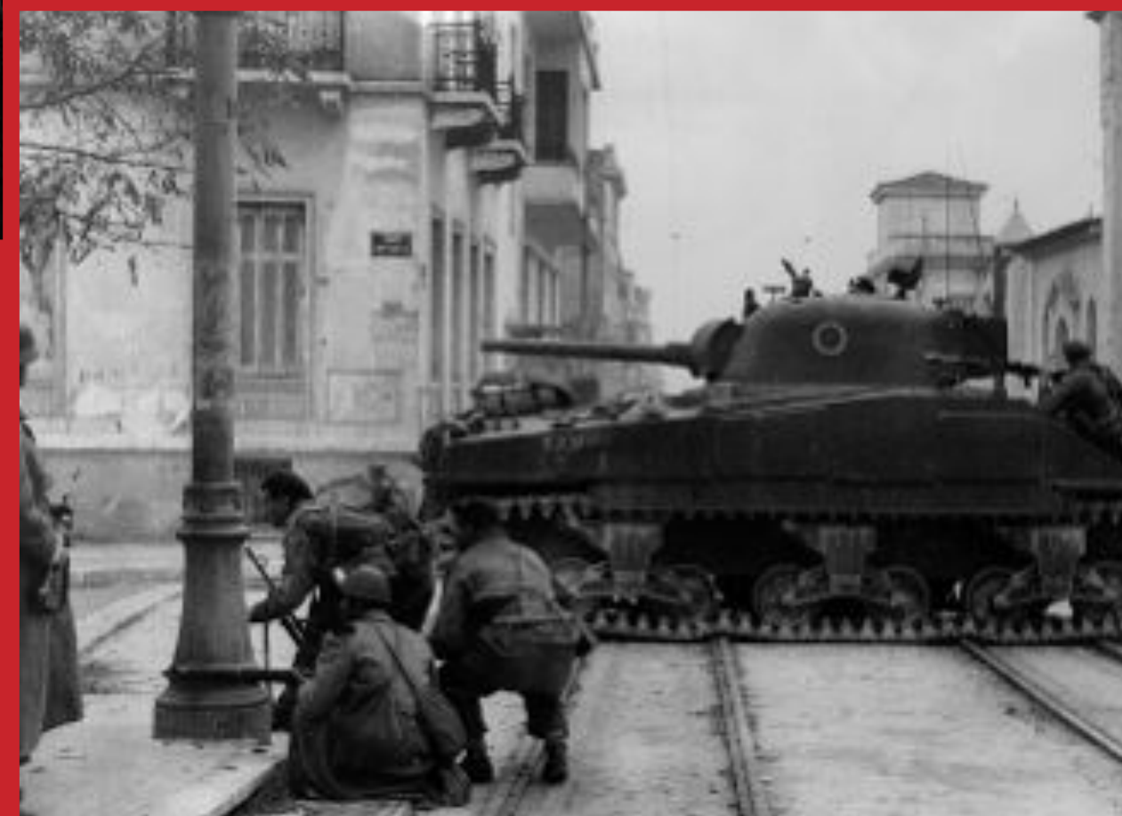
Greek Civil War (1946-1949): fighters of the Democratic Army of Greece (DSE)