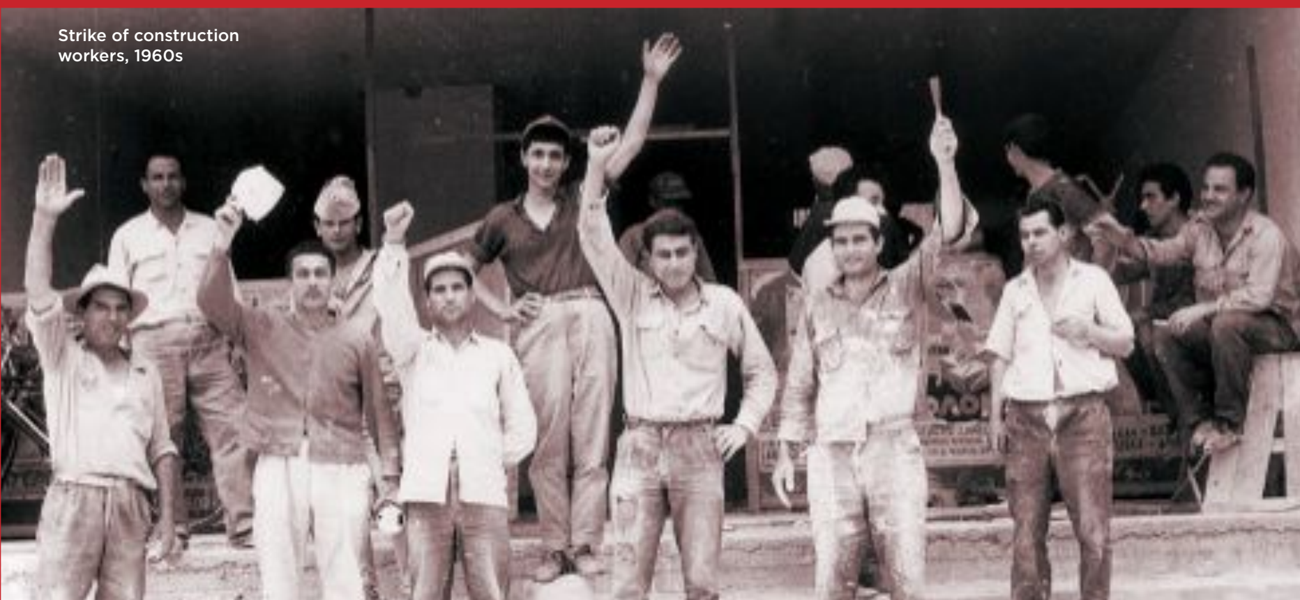
Strike of construction workers, 1960s