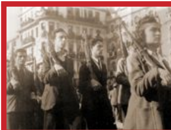
Liberation from the German Occupation, Thessaloniki October 1944