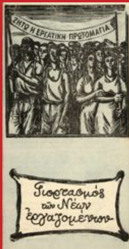
Celebration of May 1, 1950s