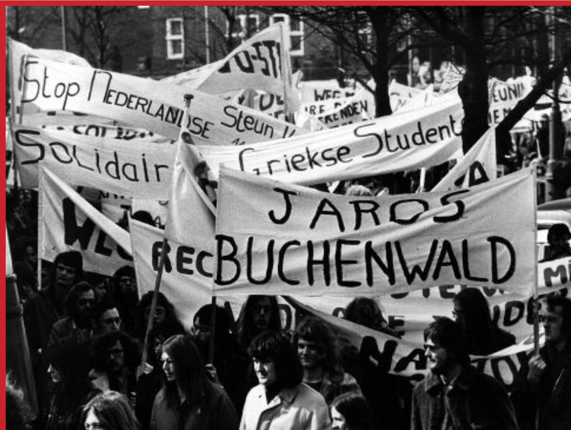
Anti-dictatorship movement: Demonstrations in the Netherlands, 1973