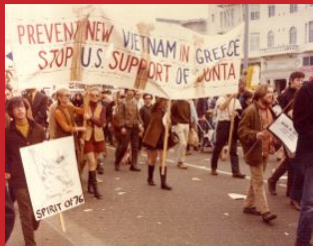
Anti-dictatorship movement: Demonstrations in the U.S.A., 1974

1 Eleftherias Square, 105 53 Athens, Greece, tel/fax: +30 210 3223062, www.askiweb.eu , email: aski@askiweb.gr , aski@otenet.gr