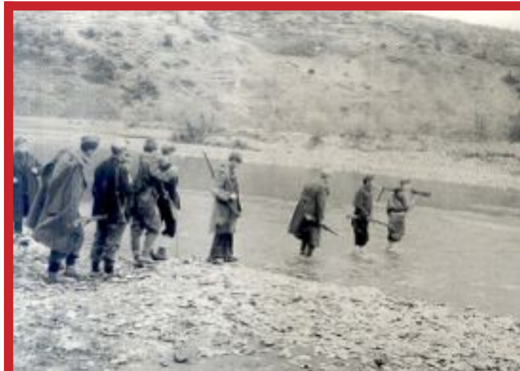
WWII: Partisans of the Greek Liberation Army (ELAS), Western Greece