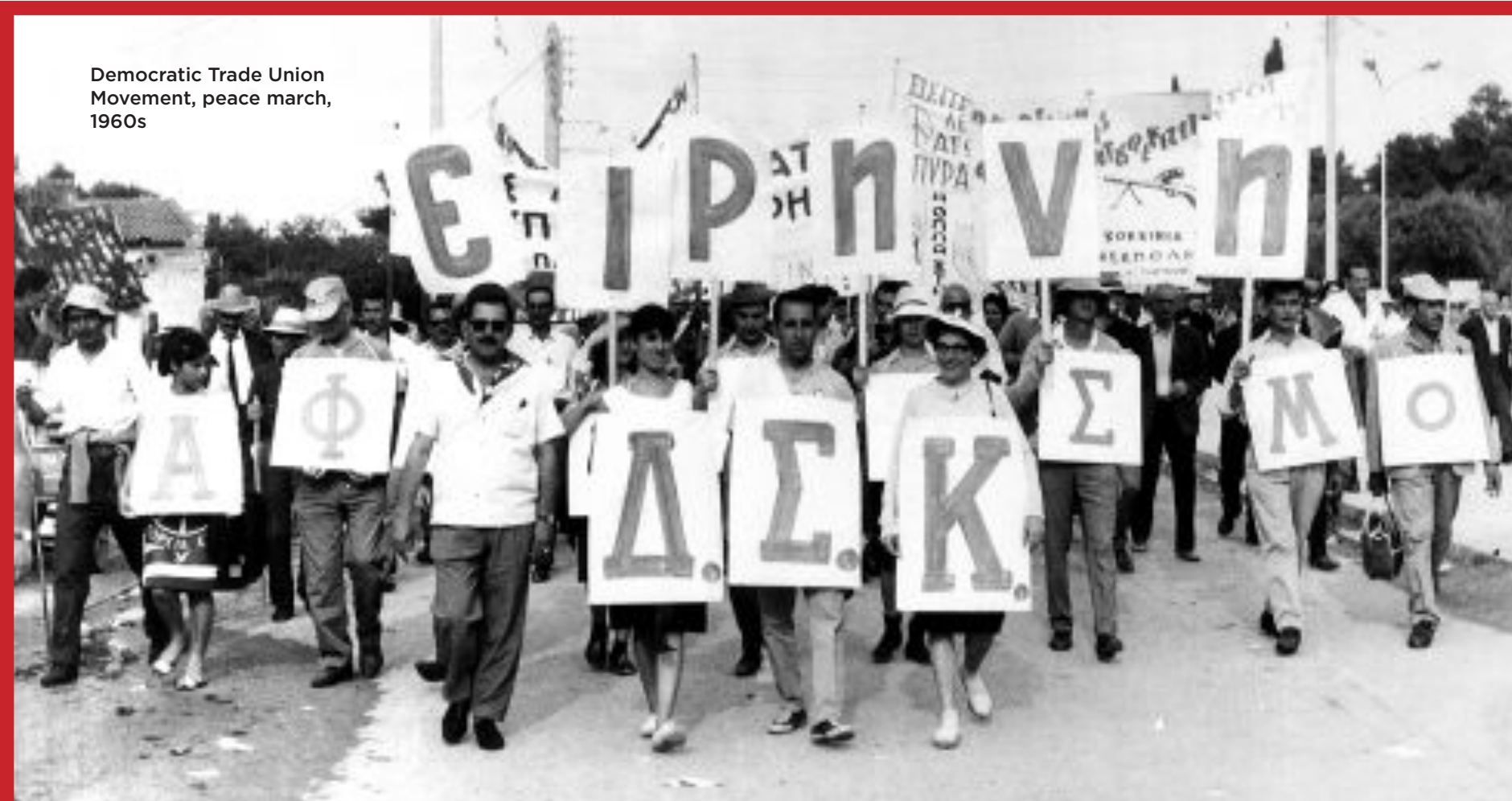
Democratic Trade Union Movement, peace march, 1960s